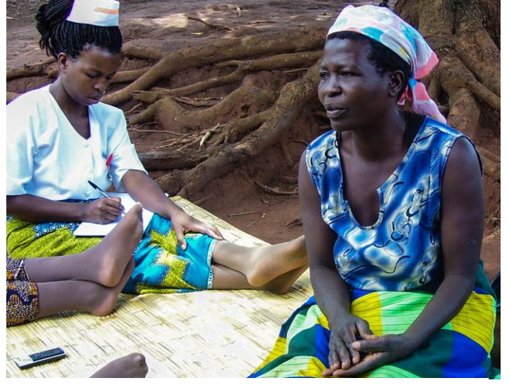
A student midwife is getting advice from a traditional birth attendant

In traditional African societies, counsel was given in various forms, the most common of which were giving advice and sharing wisdom. Giving advice has been a common way of providing help for other people. The advice offered was frequently instrumental in helping people to consider their future. In many instances, the extended family was the main source of advice for family/clan members. There was usually no shortage of people willing to share their