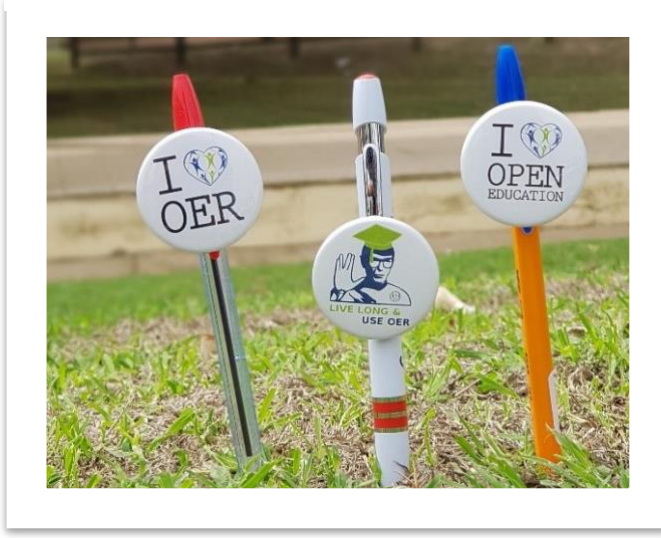
Figure 1

Open Education Influencers (OEIs), or #OpenEdInfluencers, is an initiative based at Nelson Mandela University (NMU) in Port Elizabeth, South Africa. The initiative has been operational in an informal capacity since 2015 but has been officially operational in its current form since 2018. Led by Gino Fransman from NMU, it seeks to influence decision-makers to adopt open educational resources (OER) through advocacy and facilitation, while aiming to affect decision-making and practice through activities to publicise and entrench the use of open education praxis.