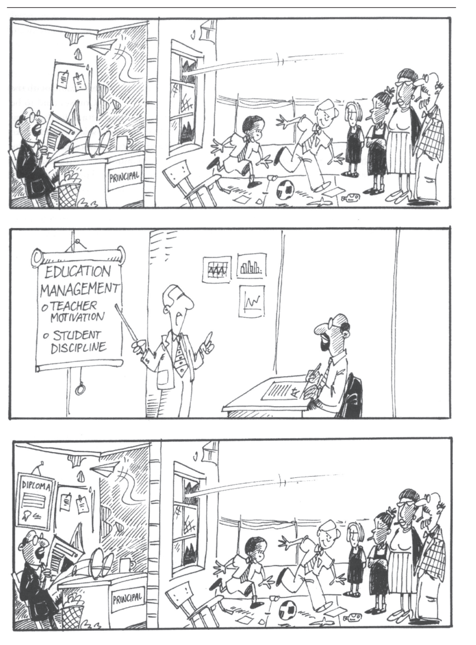
Figure 3.2 Management training.

The Thuthuka teachers also enjoy discussing this cartoon sequence. Here is Thulani's interpretation of it: