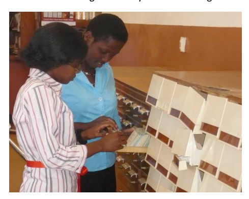
Students Searching for Library materials using a Card Catalogue

From 1990 to 2001 the Library created online databases for its books and pamphlets using a database management system called CDS/ISIS. The databases contain bibliographical details of an item.