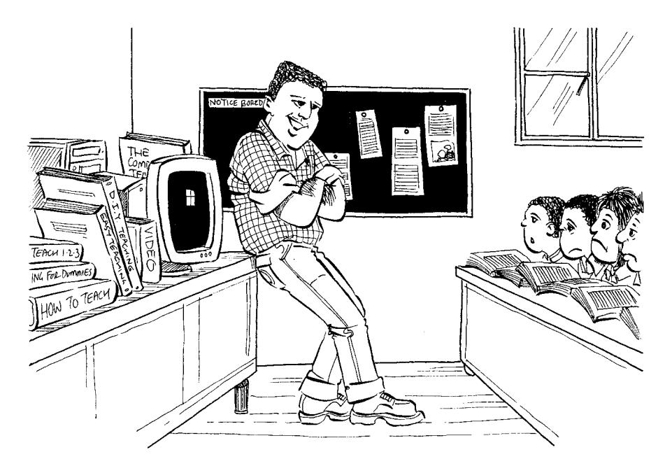
'Teacher-proof' materials are designed to minimize the role of the teacher.