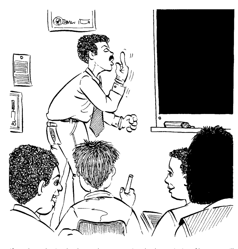
If teachers don't take themselves too seriously, the majority of learners will be their strongest allies.