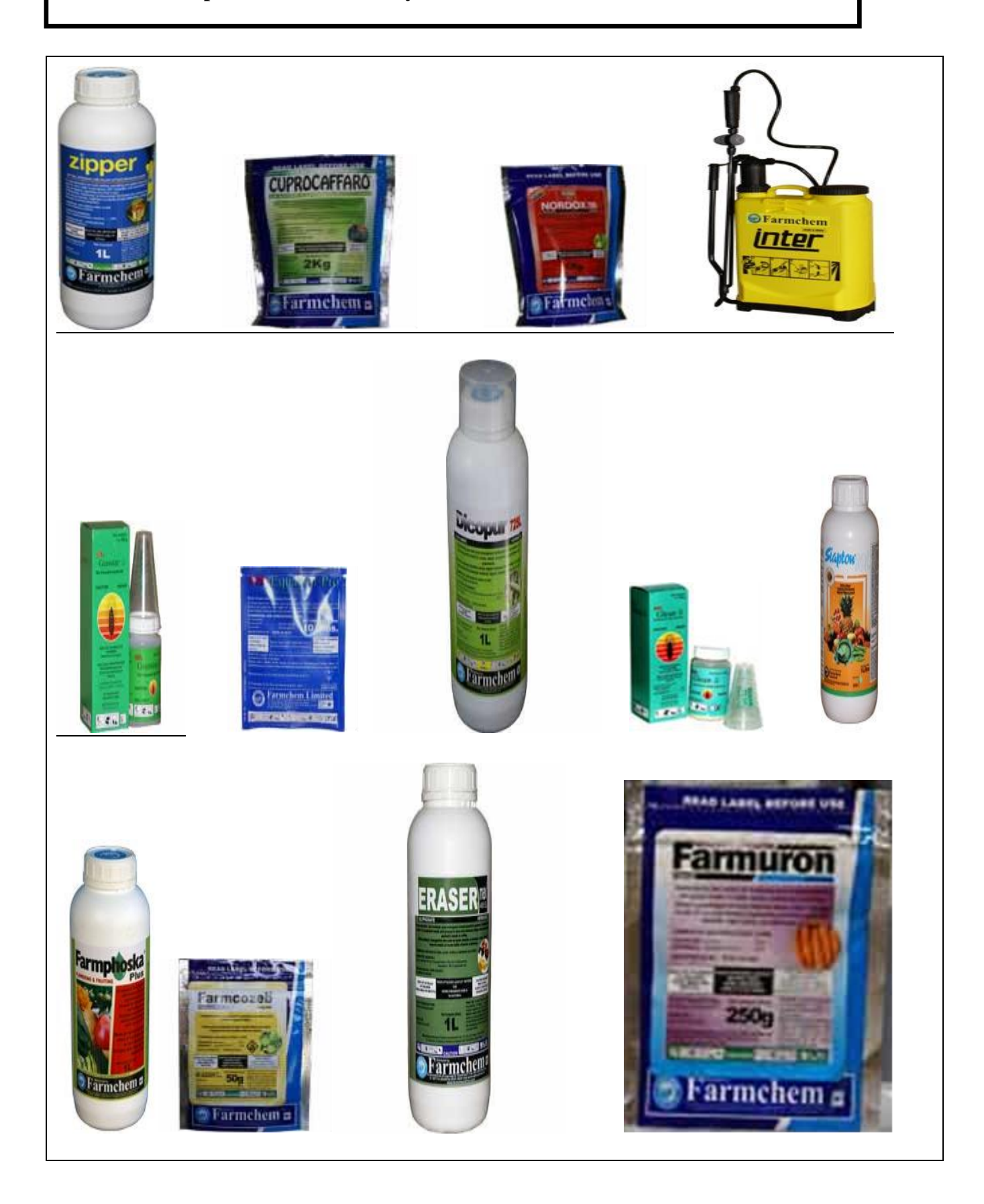
Exhibit 1: Sample of Products Sold by Farmchem